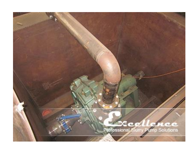
EGM-6S Coal Washery in Australia