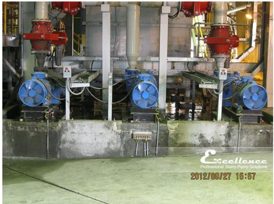
EHR-3C Copper-molybdenum Plant In Mid-East