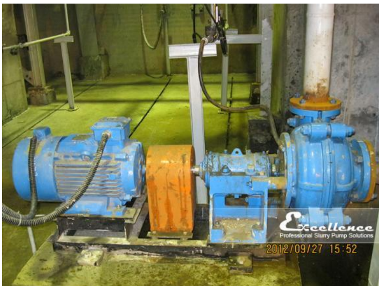
EHR-3C Copper-molybdenum Plant In Mid-East