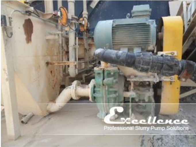
EHR-4D in the calcium carbonate factory in Asia