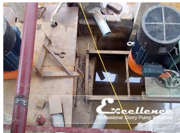
EVR-150S iron ore dressing in Vietnam